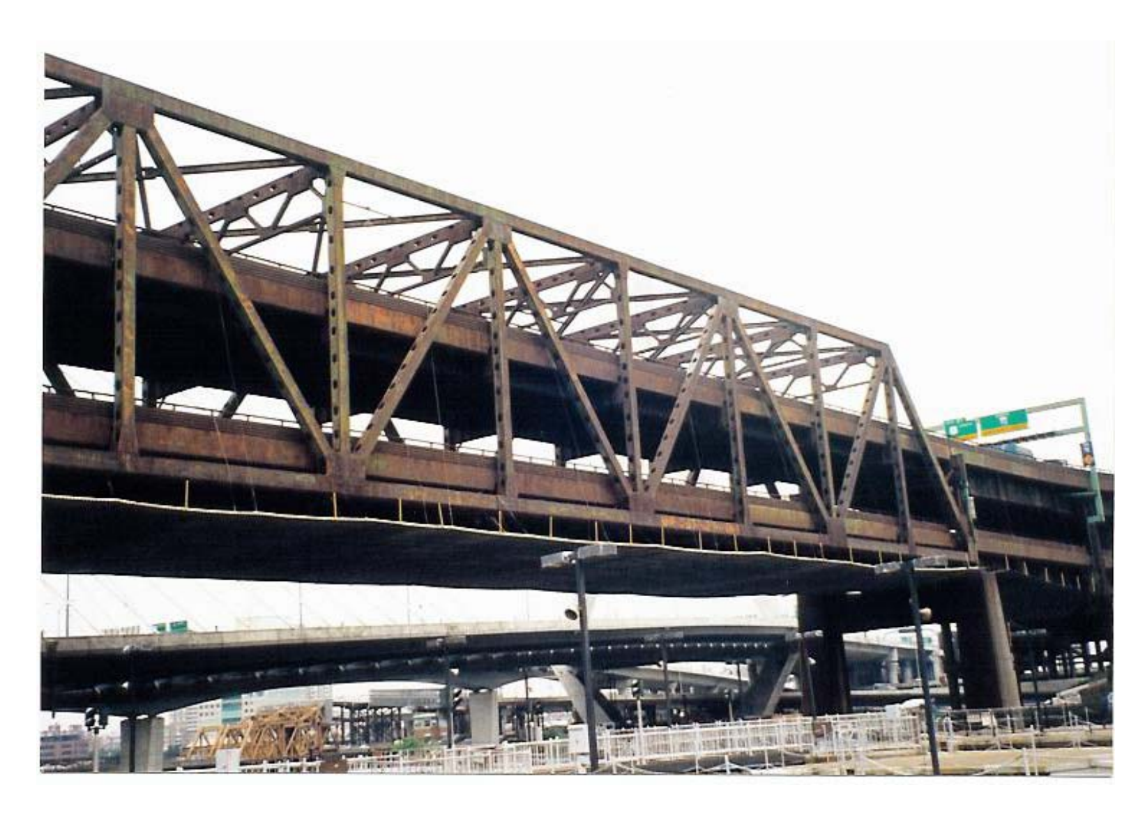
Cable Supported/Metal Deck Platform System Bascule Span Center – Truss Right W/ Containment