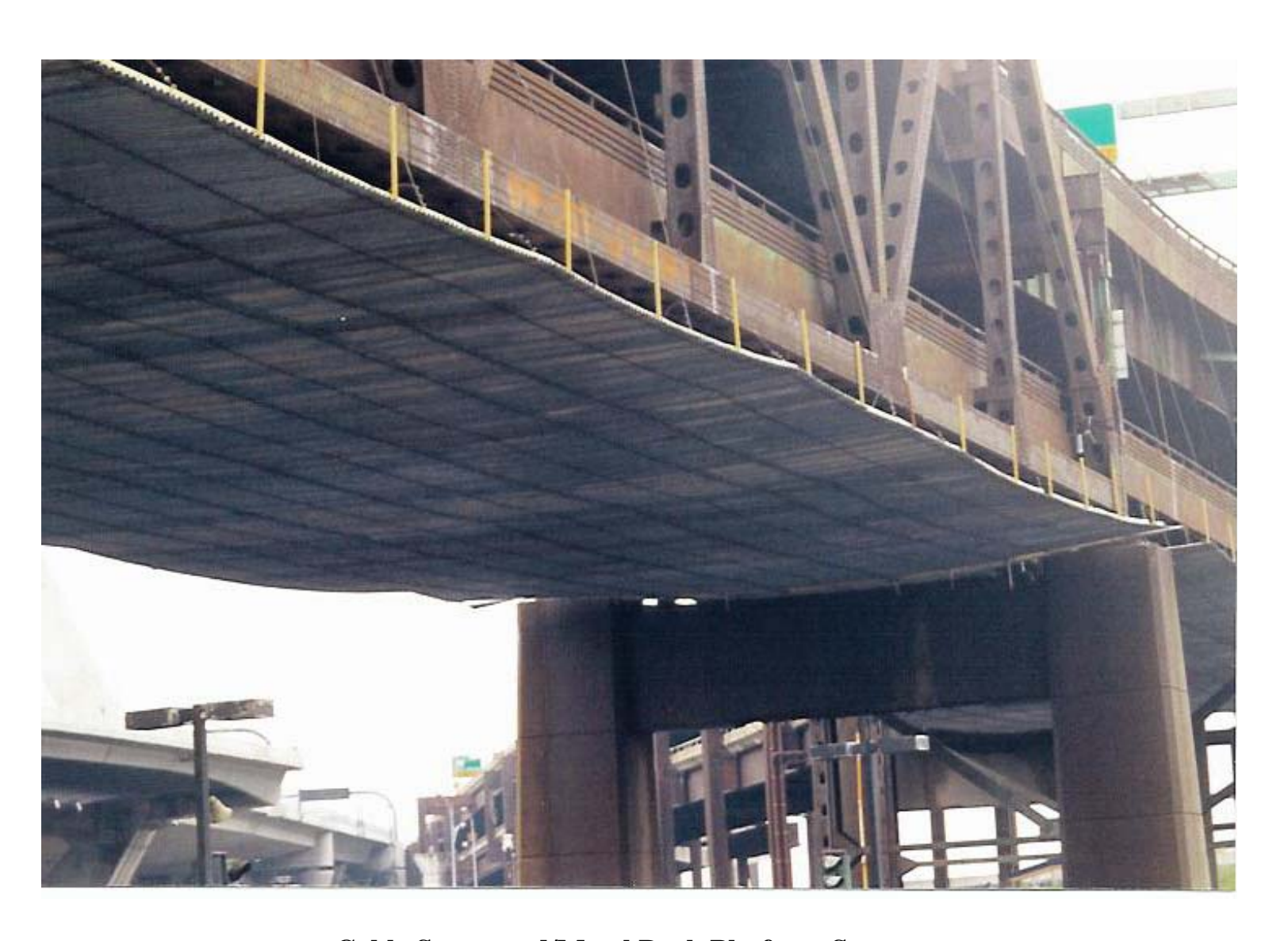
Cable Supported/Metal Deck Platform System