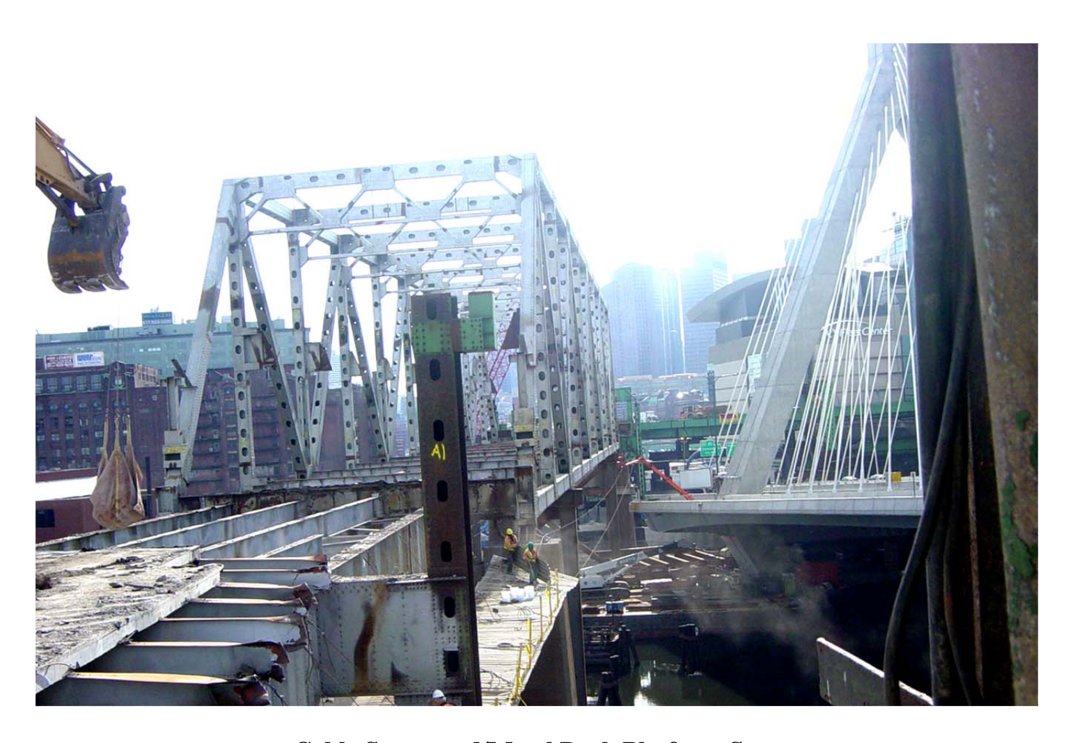
Cable Supported/Metal Deck Platform System