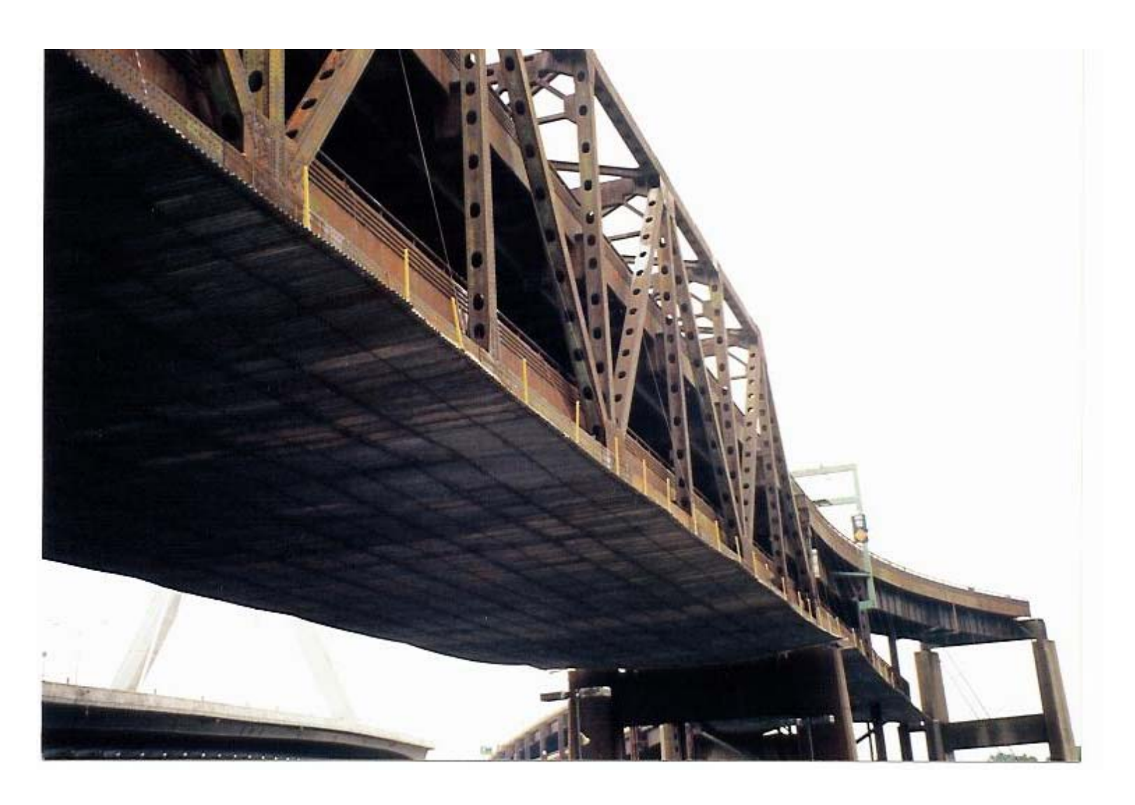
Cable Supported/Metal Deck Platform System