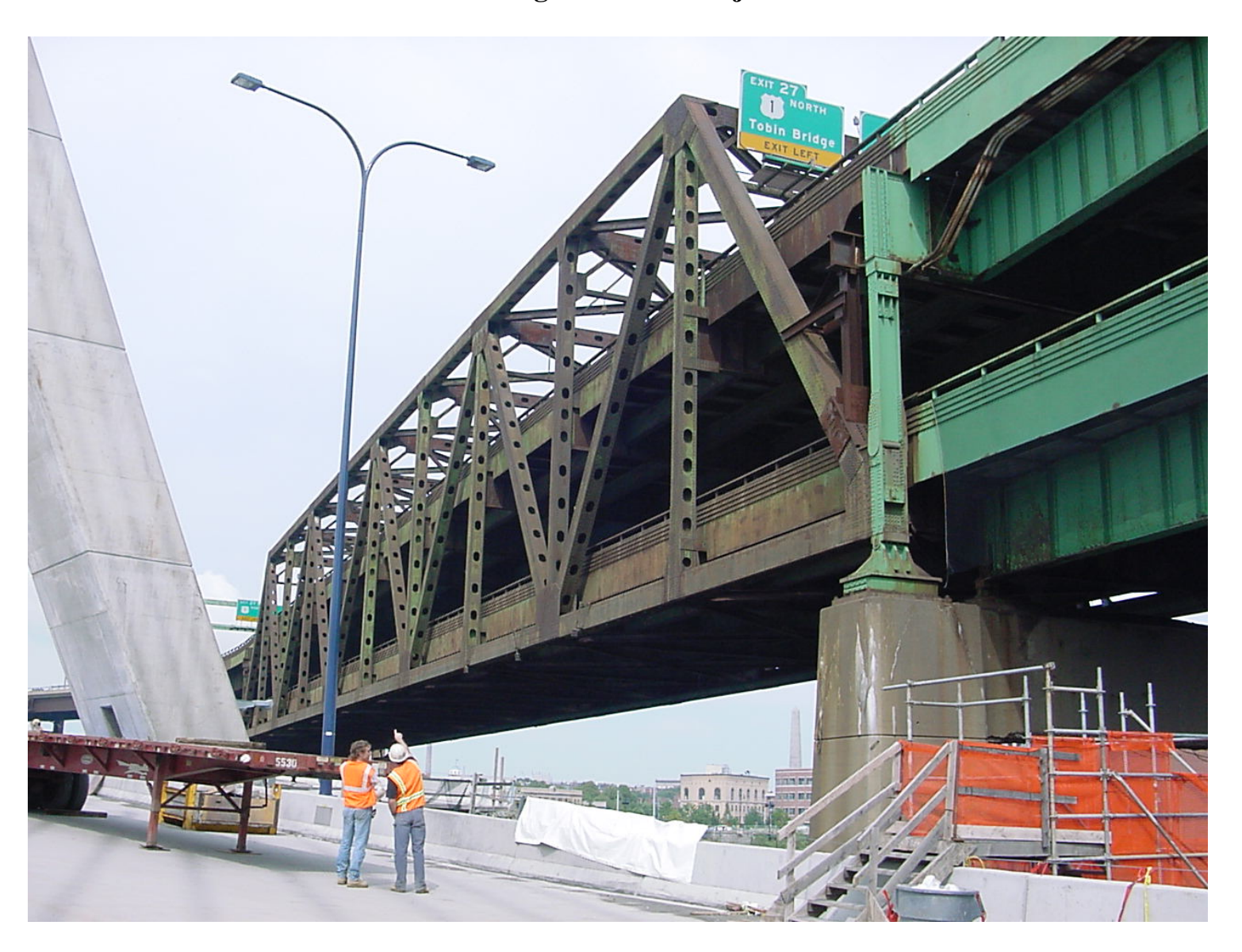
Charles River Bridge Over The Charles River

PROJECT DESCRIPTION: Bridge Removal Project