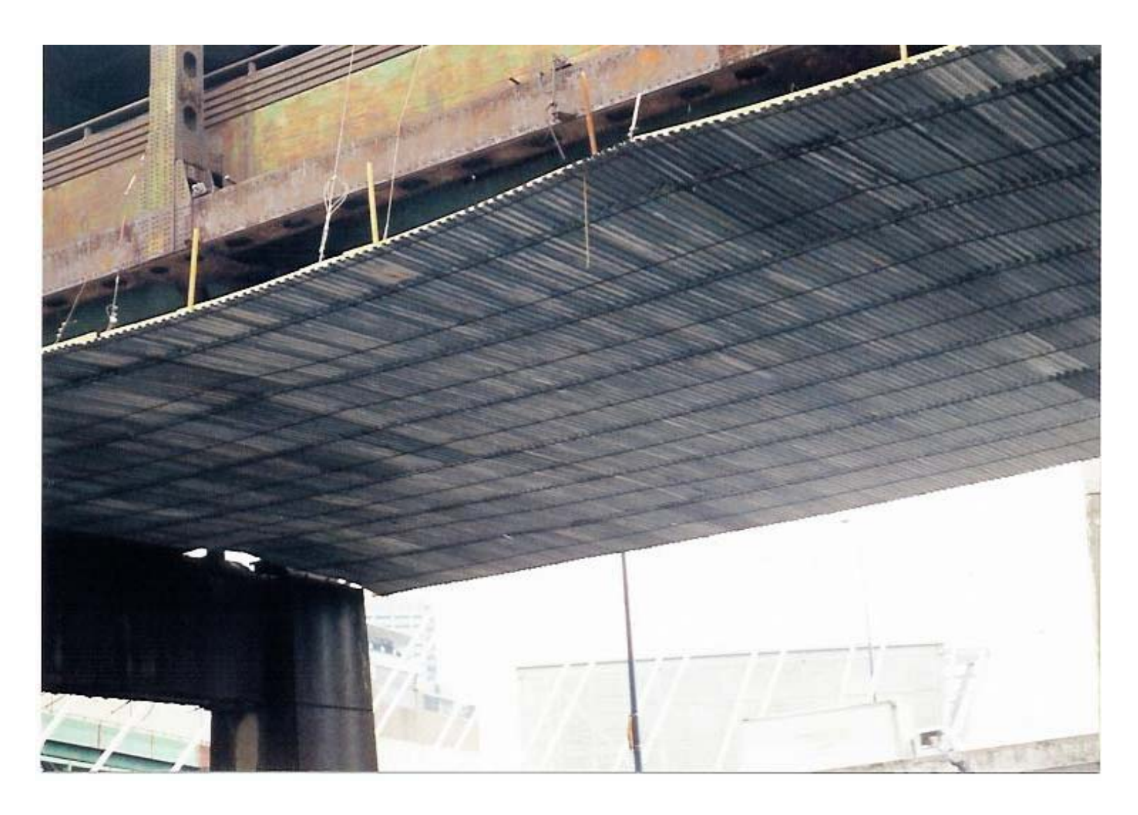
Cable Supported/Metal Deck Platform System