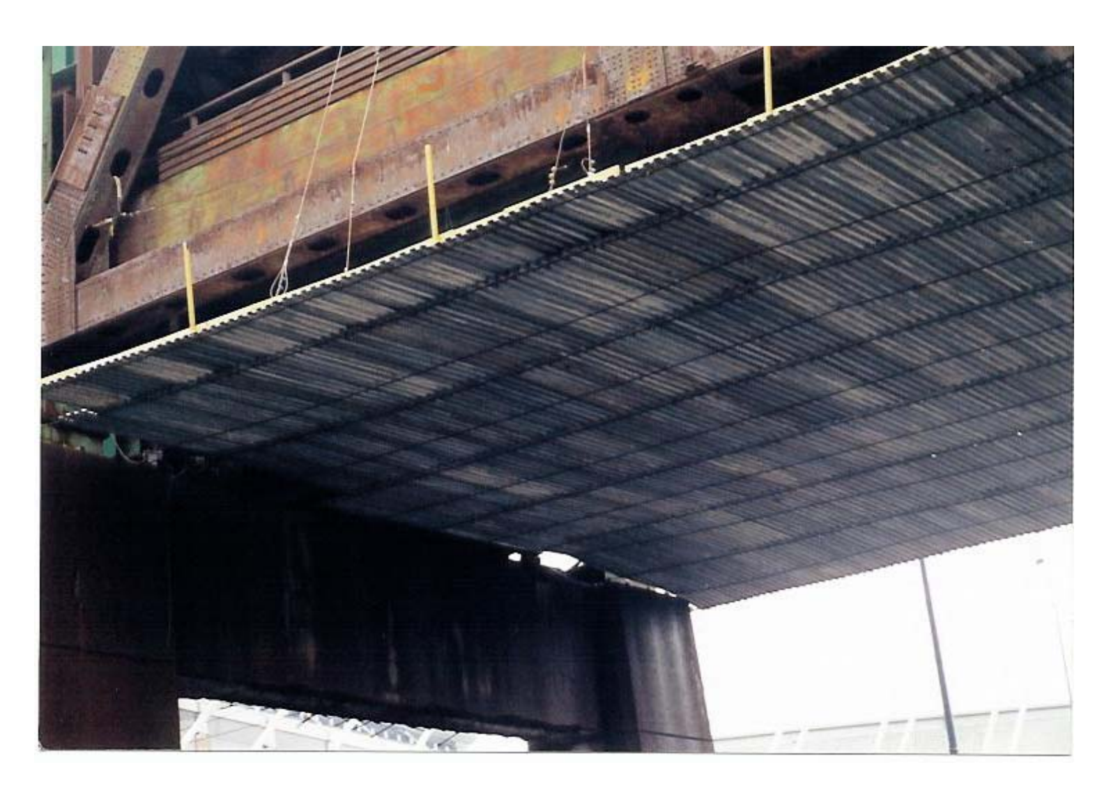
Cable Supported/Metal Deck Platform System